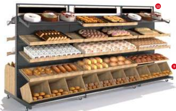
Kios Middle Unit