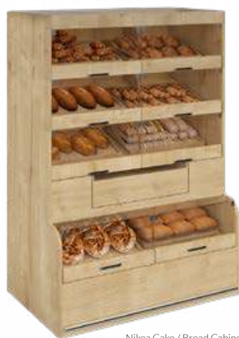
Nikea Cake / Bread Cabinet