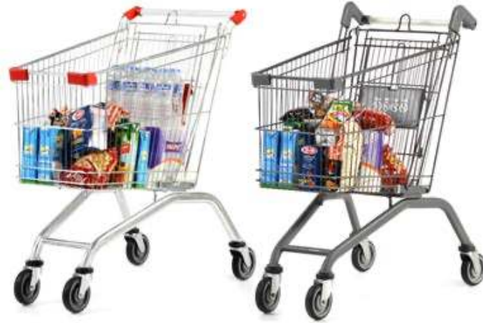
NOVA PC SHOPPING TROLLEY